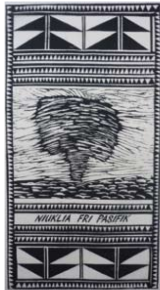
Detail of Prince of Peace Lavalava