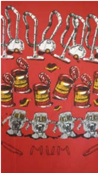
Mum 4 colour screenprint on fabric, 1992