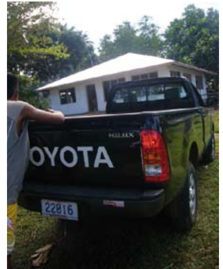
The truck purchased with the funds raised from the auction

This crucial support allowed the staff of Women in Business to continue providing valuable assistance. In addition, the psychologists also travelled to the tsunami affected areas to provide direct counselling to the most vulnerable families.'