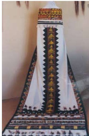
Prince of Peace robe Print appliqué, 1996