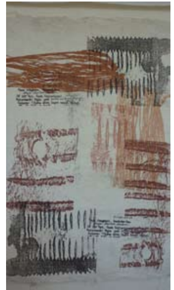
Fragments of Fragments Screenprint on tapa, 2008

There is a perception that a practitioner who teaches or assumes a serious role in education may not be considered a serious artist. In addition it is usually considered a means of generating sustainable income as a 'day job' (as I have heard others describe it) delving into this occupational pathway. In any case, a practitioner and educator each require different sets of skills and very few could excel at being genuinely passionate and successful at both.